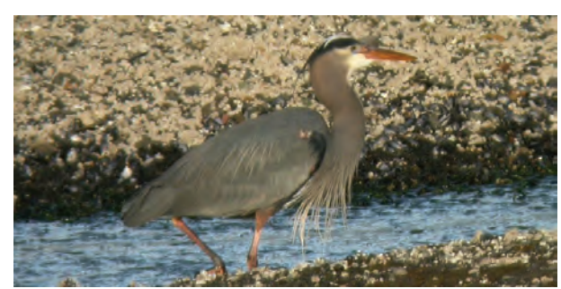
Look for great blue herons fishing along the shore near downtown Wrangell.

Be Considerate of Others. People use and enjoy Alaska's wildlife in a variety of ways. Respect private property and give hunters, anglers and others plenty of space.