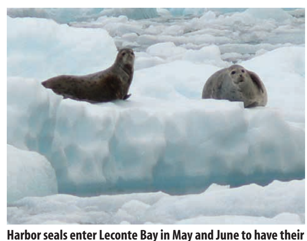
pups in safety.

Salmon Ladder near mile 11 of the Mitkof Highway is a popular salmon viewing site. USDA Forest Service cabins dot the area, each providing a unique wildlife viewing experience. Boat charters take visitors to Thomas Bay, and guided kayak trips visit Petersburg Creek on Kupreanof Island. Check with the Visitor Information Center for information on these sites.