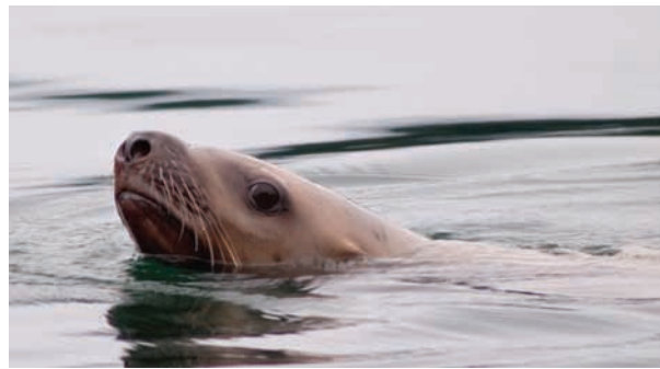
Watch for sea lions in Petersburg's harbors.

Be Considerate of Others. People use and enjoy Alaska's wildlife in a variety of ways. Respect private property and give hunters, anglers and others plenty of space.