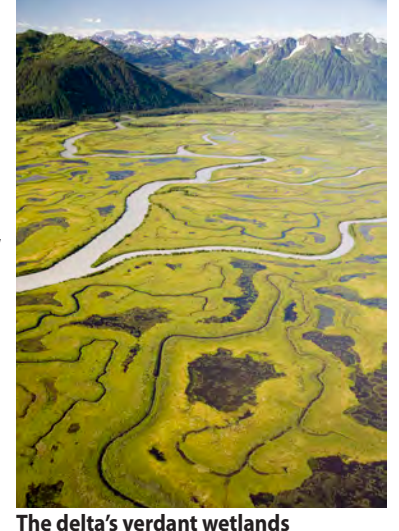
The delta's verdant wetlands

Alaganik Slough Road 7 at Mile 17 heads southeast about three miles to a boat launch, kiosk, boardwalk