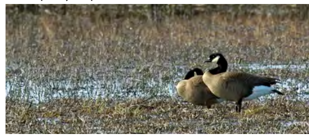
Dusky Canada geese nest almost solely on the Copper River Delta

Be Considerate of Others. People use and enjoy Alaska's wildlife in a variety of ways. Respect private property and give hunters, anglers and others plenty of space.