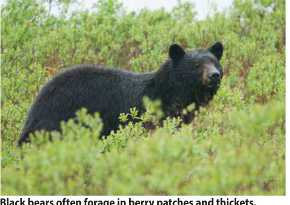
Black bears often forage in berry patches and thickets.

Copper River Delta Critical Habitat Area Alaganik Slough Copper River Delta paved road 1. Orca Road △ 🔯 0.5 hr* 6. USFS Gazebo 0.5 hr – – – gravel road ---- trail 2. Cordova Boat Harbor 📝 🖾 📼 Map is for locator reference only, 7. Alaganik Slough Road 🔼 🎑 🔯 1 hr not for navigational use. 3. Heney Ridge Trail 8. Haystack Trail ★ Hiking Trails Scenic Views 4. Hartney Bay 2 hrs 9. Saddlebag Glacier Trail Ö № 1 4.5 hrs Interpretive signs Camping ★ 4.5 hrs 5. Crater Lake Trail 10. Flag Point ○ 0.5 hr * Suggested time at location.