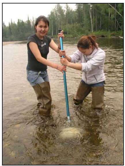
Sampling invertebrates in the Chena River ADF&G

monitor trends in species, species assemblages, and habitats; and