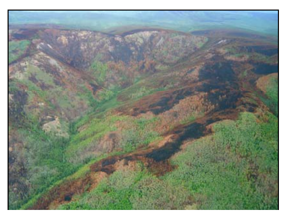
Mosaic pattern in vegetation after wildfire

Periodic wildfires generally benefit wildlife. Because wildfires typically burn erratically, they leave a patchwork of vegetation across the landscape. This mosaic pattern is the key to habitat diversity because it maintains multiple stages of forest succession. Some species thrive in the new growth that comes after a fire, while others need the patches of older unburned forest that are left standing after a typical wildfire. Some species use both types of habitats, but need them at different times of the year or for different life stages.