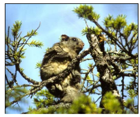
Northern flying squirrel

The distribution of many small terrestrial mammals remains unknown except for anecdotal information and isolated studies in small areas. Specific habitat use and migratory movements of most mammals have not been mapped. It may be more appropriate to model these habitat uses and migratory routes once adequate land cover data are available. There is a need for additional understanding of the genetic relationship among island endemics and their taxonomic status.