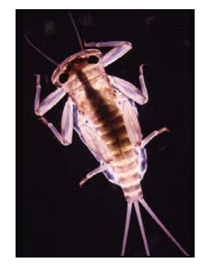
The mayfly Rhithrogena

Known locations of many aquatic invertebrate and vertebrate species primarily result from opportunistic inventories and not from comprehensive surveys. The locations of overwintering areas used by invertebrates and resident fish, including springs, deep lakes or side channels of rivers, are not generally known for most watersheds in the state. Data on spawning and rearing areas and refugia sites are also poorly known. Since the early 1980s when the Alaska Habitat Management Guides were written, there has been no central repository for the fish habitat data of agencies and nongovernmental organizations.