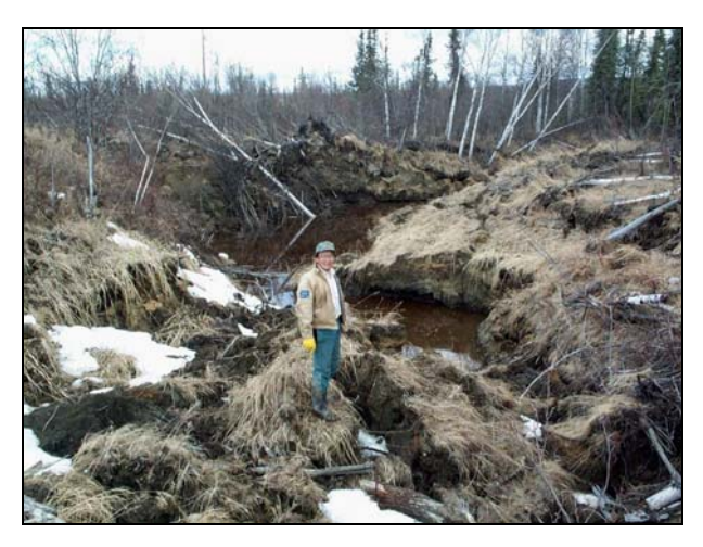
Destruction of ground surface and vegetation due to thawing of ice-rich permafrost and thermokarst formation, near Fairbanks.

Experts also expect Alaska's terrestrial landscapes and natural vegetative communities to be significantly altered. Alaska has more than 175 million acres of