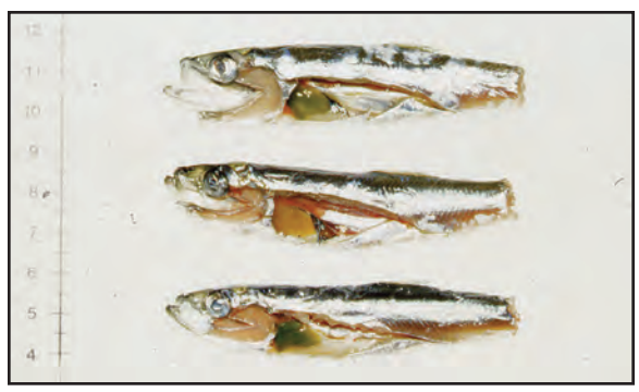
Anemic Pacific herring with very pale gills and green livers from excessive biliverdin commonly seen with VEN