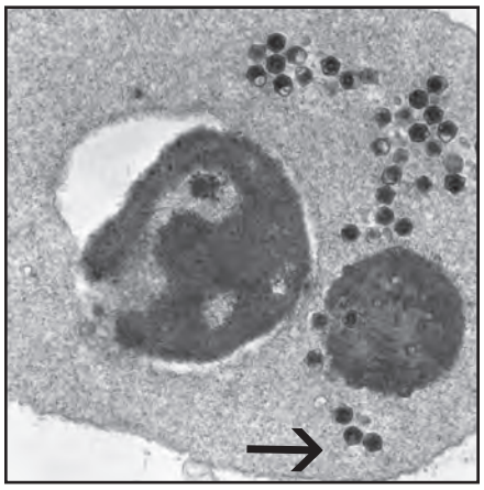
TEM of infected erythrocyte showing large virus particles (arrow) comprising the lattice surrounding inclusion bodies in stained smears, X 15,600.