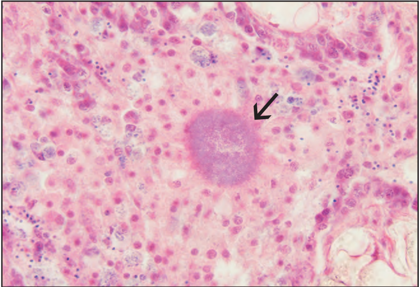
Typical subsurface radiating granuloma (arrow) containing central Nocardia organisms surrounded by host inflammatory cells, histological section