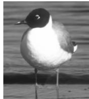
JON NICKLES, USFWS

Glaucous-winged and herring gulls adapted easily to the increase in human garbage available in Anchorage, and are commonly seen at dumpsters. Although population surveys have not been conducted, biologists have counted more than 100 ground nests on a single empty lot in midtown Anchorage each spring. Large gulls become nuisances by vigorously defending nests on roofs and other structures, destroying roofing, fouling water, spreading avian diseases, and increasing nest predation on other birds. In 1999 natural resource agencies received more calls complaining about gulls than about any other birds. The USDA Wildlife Services program had contracts with 10 local businesses to remove gull nests where aggressive gulls threatened human safety, and the Municipality removed gull nests from several problem areas. Elimination of waterfowl feeding, and better attention to covering dumpsters, might help reduce the numbers and problems associated with large gulls.