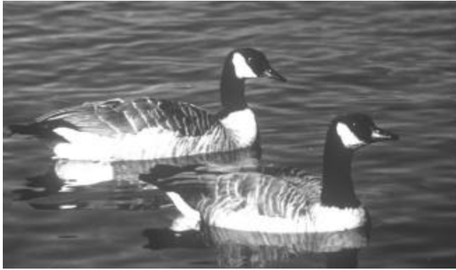
US FISH AND WILDLIFE SERVICE

Geese are a significant threat to aircraft (an Air Force plane crashed in 1995 after colliding with a flock of geese and 24 people were killed), and local air fields all have active harassment programs designed to keep geese from those areas. Geese can also become a nuisance around lakes and at parks, ball fields, and golf courses. Their feces make areas unattractive to many people and may contribute to the dispersion of a parasite that causes swimmer's itch. Chapter 5 contains a section summarizing the extensive management efforts associated with this species.