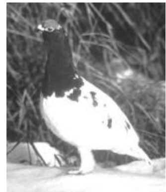
US FISH AND WILDLIFE SERVICE

Alaska's state bird is the willow ptarmigan, which is found year-round in the Chugach Mountains