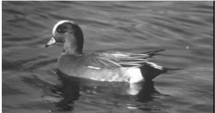
US FISH AND WILDLIFE SERVICE

Anchorage wetlands and bodies of water provide habitat for many waterfowl like this wigeon