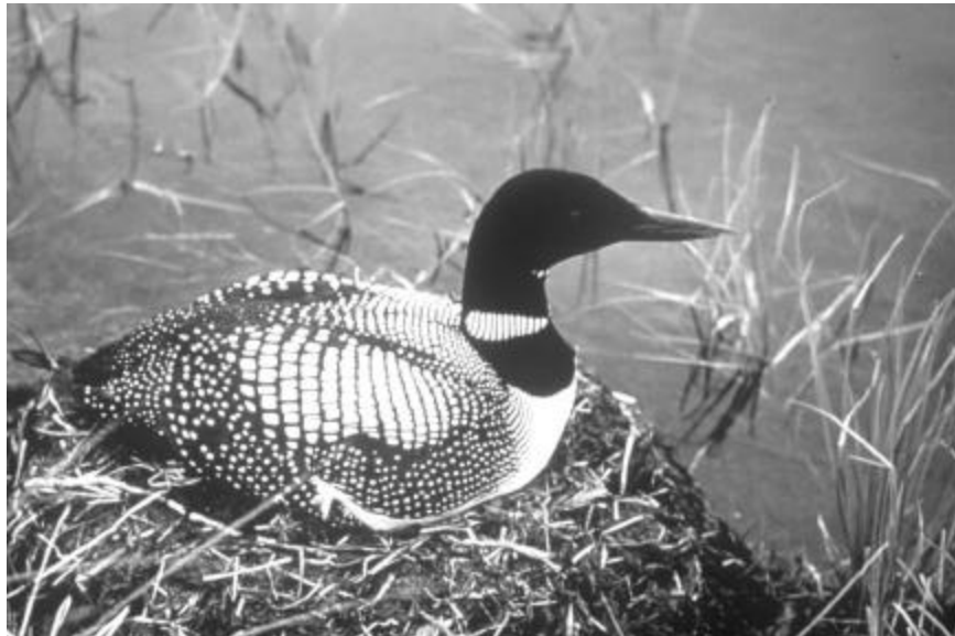
US FISH AND WILDLIFE SERVICE

This is a common loon. Pacific loons, with gray head and bright throat patch, also nest in Anchorage.