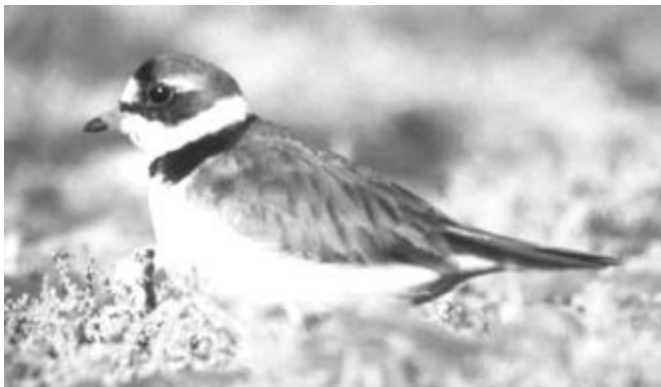
US FISH AND WILDLIFE SERVICE

Shorebirds. Forty species of shorebirds have been recorded in the Municipality (Scher, 1993), but only ten (including common snipe, lesser yellowlegs, short-billed dowitcher, least sandpiper, semipalmated plover, and spotted sandpiper) appear to regularly nest in the Anchorage Bowl. Other species, including Hudsonian godwits, may occasionally breed in the area (C. Maack, personal communication, 1999). Because considerable wetlands in the Bowl have been drained since 1950, breeding populations of these water birds have probably also declined (L. Tibbitts, personal communication, 1999). Retention of remaining wetlands within the Bowl will help ensure persistence of breeding species; protection of nesting areas from human disturbance may also be important and is addressed through recommended actions in this plan.