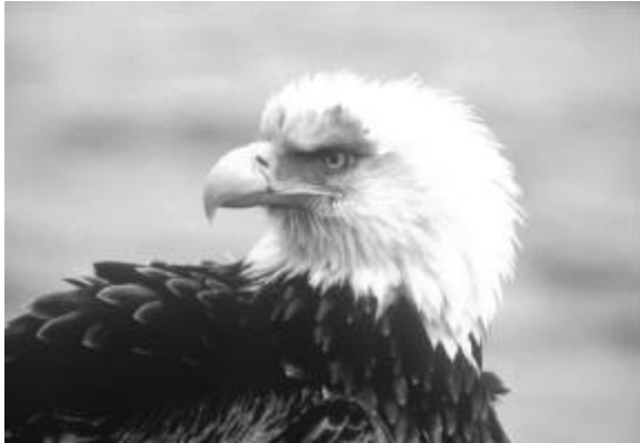
US FISH AND WILDLIFE SERVICE

Bald Eagles. There are probably dozens of bald eagles resident in the Municipality, and there are at least 9 nesting pairs in the Anchorage Bowl, with higher population numbers in winter. Eagles generally live and feed along streams, lakes, or the coast, but eagles occasionally scavenge human trash in Anchorage, particularly in winter. The eagle population in Anchorage appears to be stable or increasingly slightly.