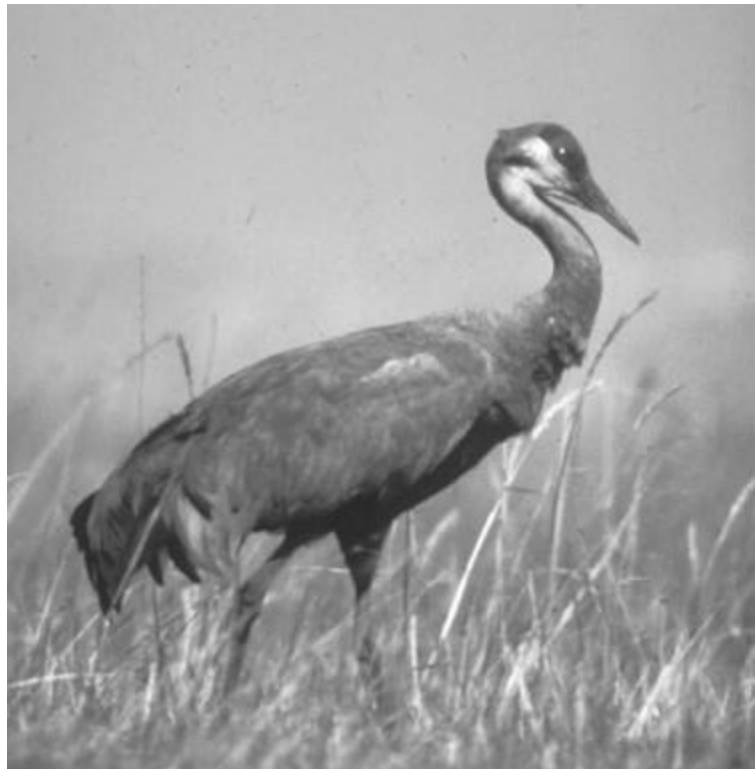
US FISH AND WILDLIFE SERVICE

While most noticeable in Anchorage when giving their loud, gurgling call during migratory flights, sandhill cranes also nest in our coastal wetlands.