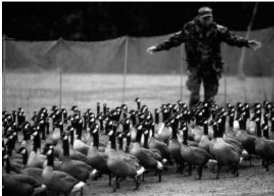
ELMENDORF AIR FORCE BASE

Anchorage has over 4,000 resident geese, and many others fly through the area during their annual migration