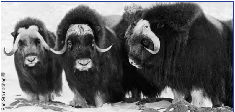
Photo 27: Left to right; 3-year-old bull, mature bull, and 3-year-old bull, spring

When hunting, it is important to know what lies behind your target before you shoot. Muskoxen cluster together which many hunters are not accustomed seeing. Young muskoxen often stand behind larger animals for protection. Although muskoxen are large solid animals, bullets from high powered rifles are capable of passing through the target animal and wounding another hidden animal. Take your time! The group will eventually disperse giving you a clean shot.