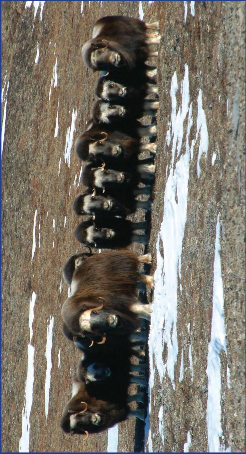
Photo 45: left to right: 3-year cow, calf, mature bull, mature cow (behind), 2-year bull, 2-year cow, calf, 3-year bull, 2-year bull, 2-year cow, calf, mature cow, spring