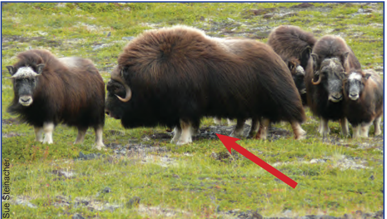
Photo 35: yearling, mature bull (small muskox behind), mature cow, calf, fall

NOTICE EXTRA LEGS BEHIND BULL! Don't Shoot! Wait for the animals to disperse.