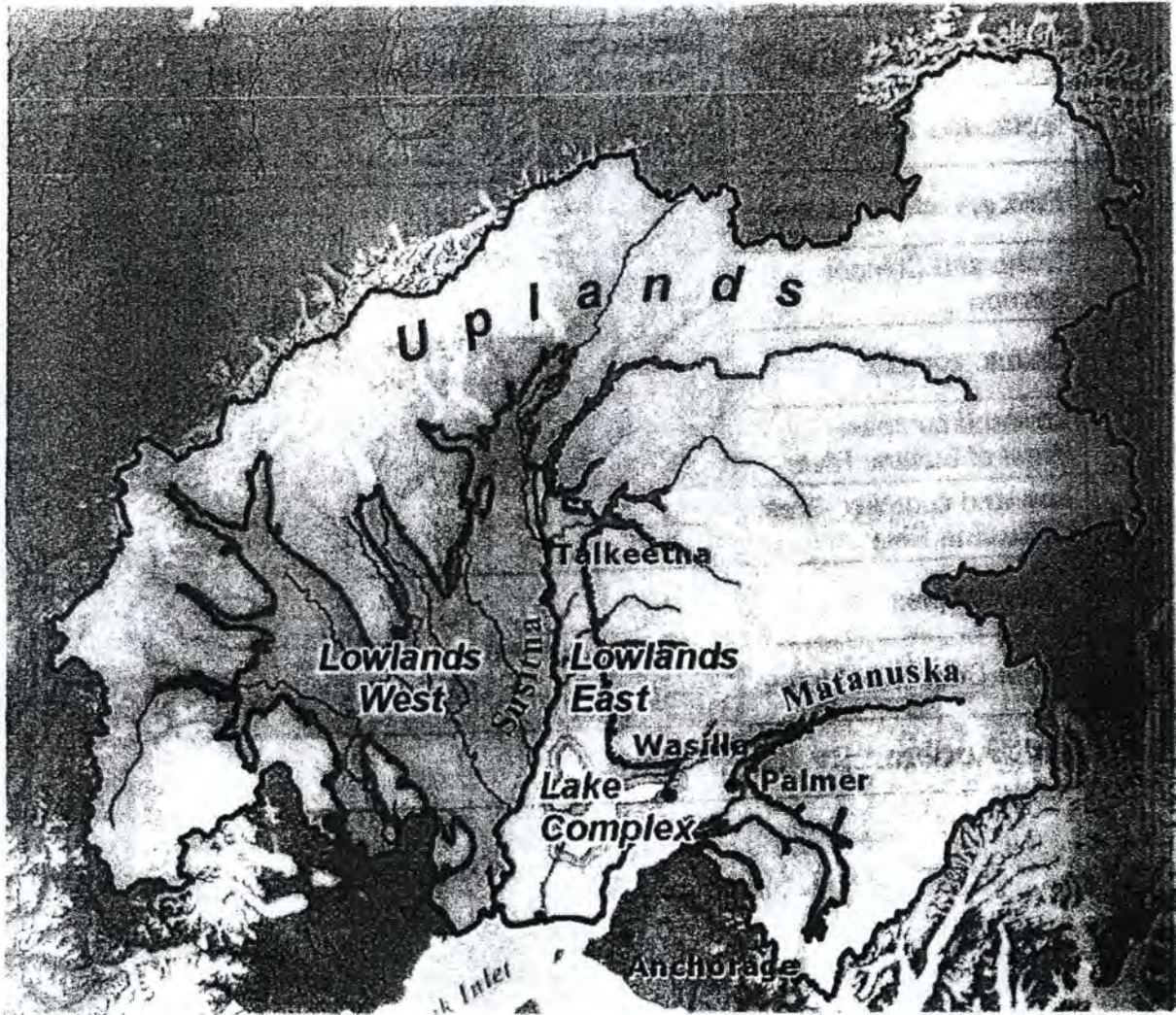
Figure 8. Terrestrial Ecosystem Targets in the Mat-Su Basin