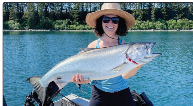
Chinook salmon caught in Yakutat Bay.