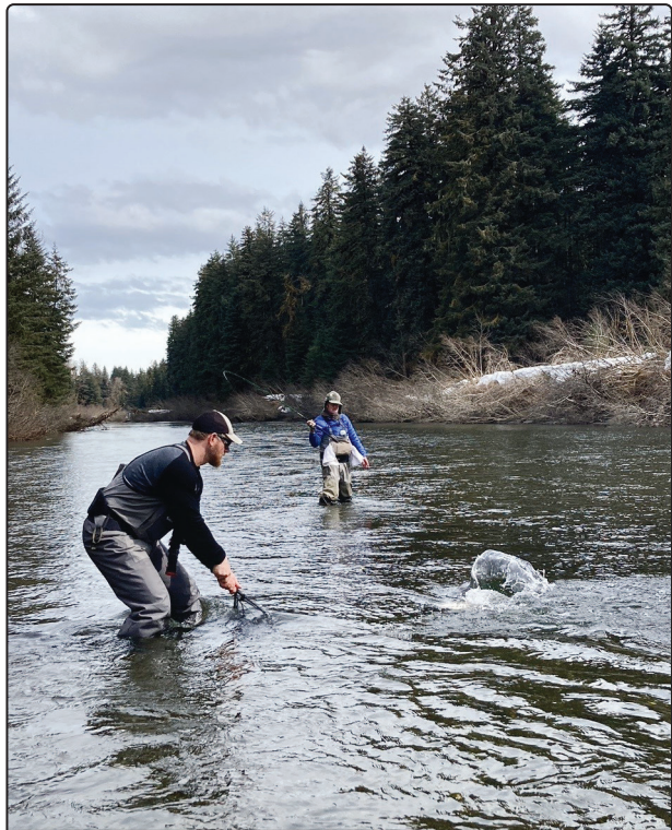
A float spinning rod setup for the win.