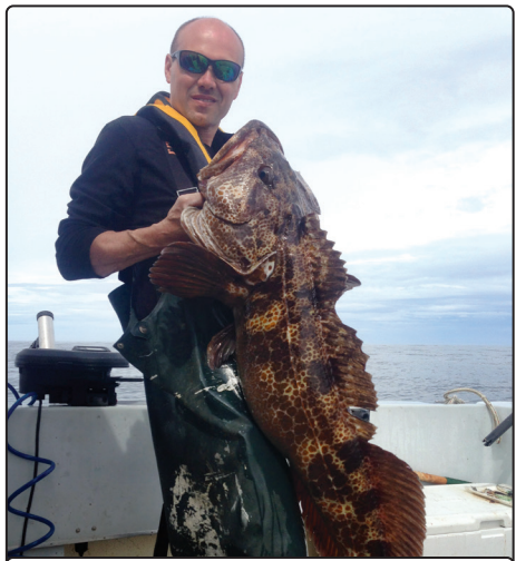
A beast lingcod from SE waters.