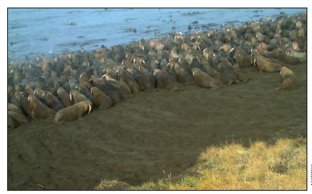
Pacific walrus fleeing a terrestrial haulout in response to human induced disturbance.

Marine mammals swimming or hauled out on land, rock or ice are sensitive to boats, and human presence. Noises, smells, and sights may elicit a flight reaction. Trampling deaths associated with haulout disturbance are among the largest known sources of natural mortality for walruses. Frequent or prolonged disturbances may even result in long-term haulout abandonment. Your vessel may not be the only one that day that has interacted with a particular group of walruses, please be aware that increasing levels of disturbance may occur with each successive interaction.