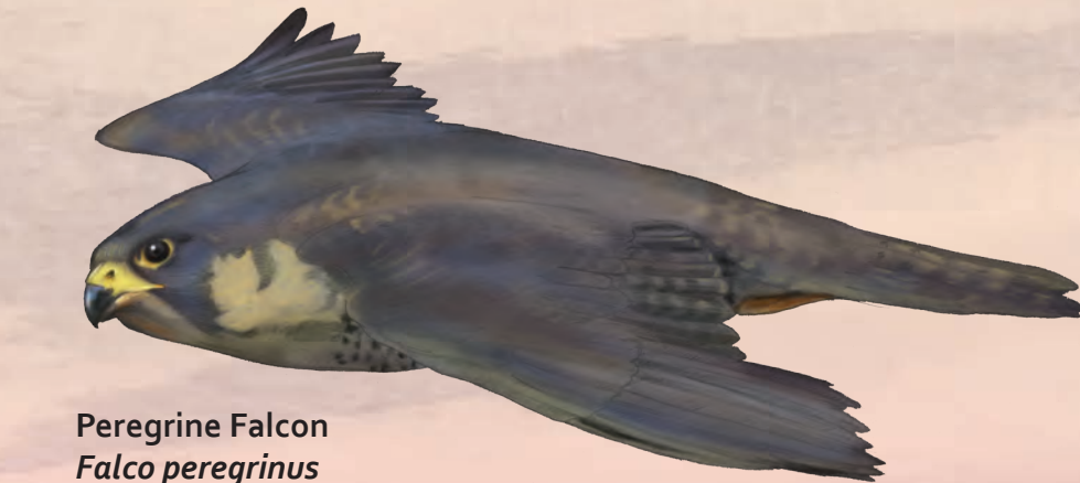
Peregrine Falcon Falco peregrinus