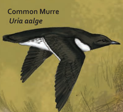
Common Murre Uria aalge