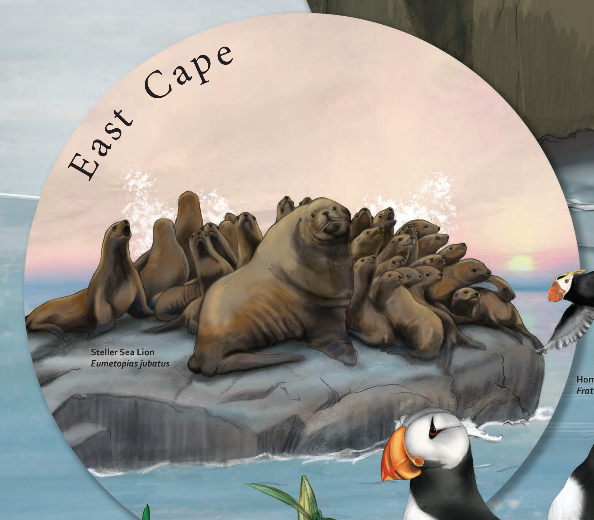
Steller Sea Lion Eumetopias jubatus

Bristol Bay's marine buffet draws a diverse group of marine mammals, seabirds, and other marine wildlife to the sanctuary, including Gray, Humpback, and Killer Whales and 115 bird species. Over 200,000 seabirds nest on Round Island. Resident Red Foxes and Common Ravens prey on nesting Tufted and Horned Puffins, Black-legged Kittiwakes, Common Murres, their chicks, and eggs.