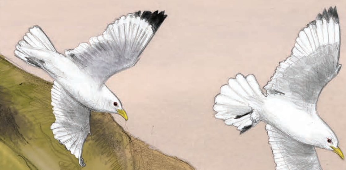
Black-legged Kittiwake Rissa tridactyla