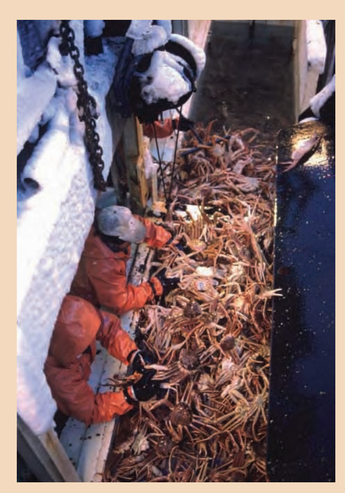
Bering Sea crab fishery.

then up to the Yukon when the ice'd go out and from there back to Bristol Bay, over the hump to Cook Inlet, then charter a plane through the slot to Prince William Sound. I'd get home about the end of August."