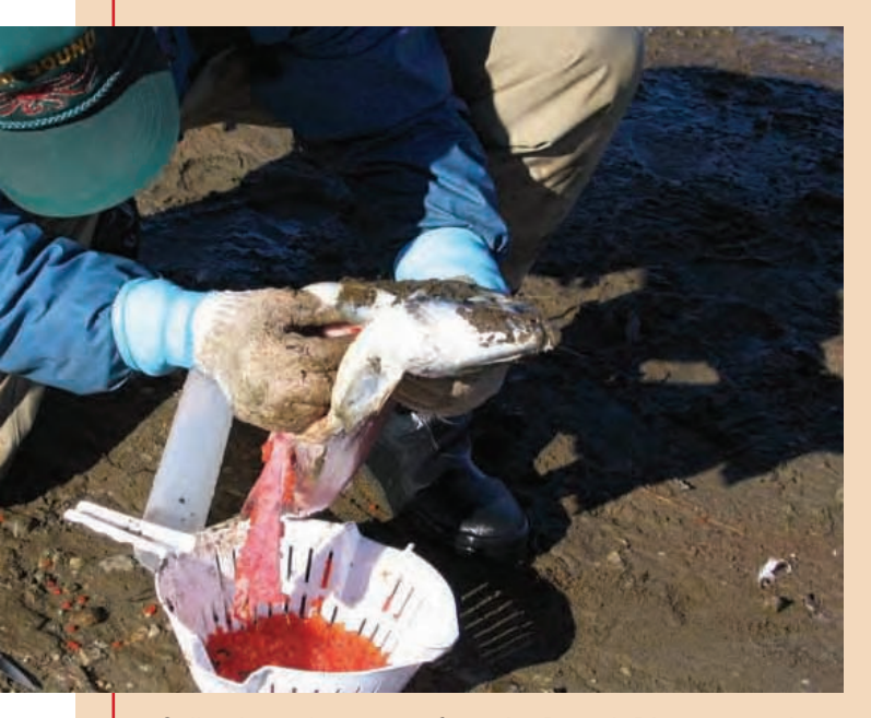
Collecting salmon eggs from the Branch River system in Bristol Bay.

Global climate change and ocean acidification are affecting the waters on which Alaska's and all fish stocks depend. Some species already appear to be on the move. Alaska pollock are reportedly heading north in search of cooler water while southern species like jumbo squid and sardines are becoming more abundant in Alaska water. Tuna might not be far behind.