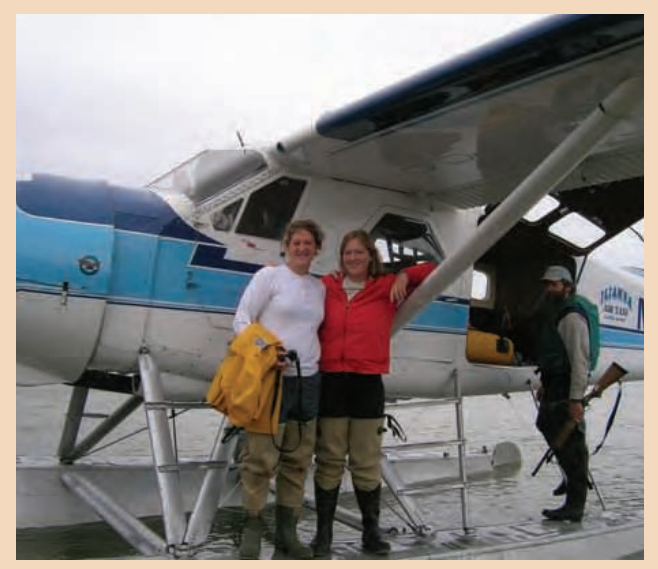
ADF&G researchers arrive in Bristol Bay by floatplane.

One former biologist observed that the Department of Fish and Game was better supported before the oil pipeline brought its riches to the state. At statehood, fisheries were a major driver of Alaska's economy but now are