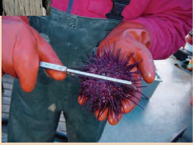
Measuring a sea urchin.

Well down from its peak production, 65 million pounds of shellfish were landed in 2007 worth $133 million. That included 19 million pounds of king crab worth $59 million and 36 million