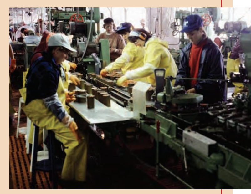
Cannery workers in Dillingham.