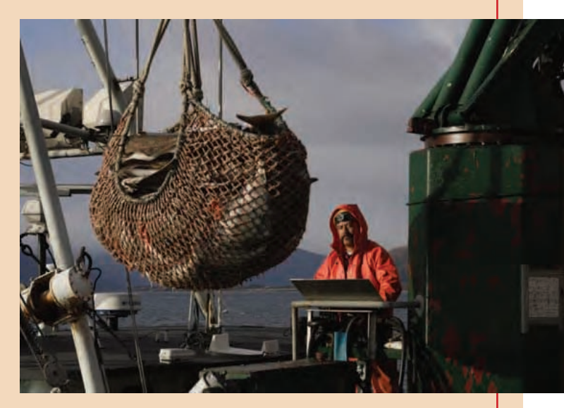
Halibut delivery to processing plant.

It also took recognition of external threats to Alaska's resources such as high seas interceptions and investing the time to address these