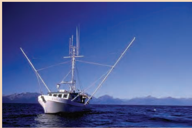
Trolling for coho salmon.

Ask former biologists from the Alaska Department of Fish and Game and others involved in the industry's development what it took to achieve the success seen in Alaska's commercial fisheries and they will attribute multiple reasons. At perhaps its most basic level, it begins with Alaska itself.