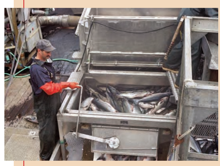
Tendering salmon.

people, has a feeling for what's going on and the fisheries over time, you get a better managed fishery. That's the key and that's why Alaska has been so successful."