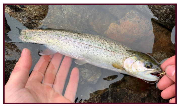
Rainbow Trout (Oncorhynchus mykiss)

Pink or humpy salmon in the Anchorage area range from 2 to 10 pounds. Almost immediately after they emerge, the juvenile fish migrate to saltwater. They spend one winter feeding in the ocean on larval forms of various sea life and small fish before returning to spawn the next summer. This creates an 'every-other-year' cycle. In the Anchorage area the strongest pink salmon runs and availability occur on even years, with the peak in mid-July through early August.