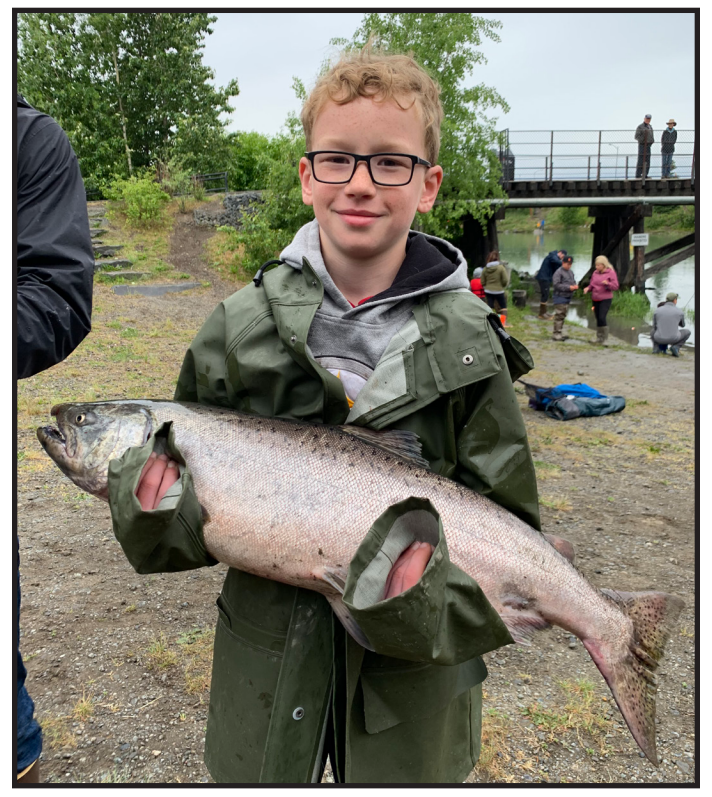
Ship Creek Access

On the third Saturday in June, from 6:00 a.m. to 11:00 p.m. a section of Ship Creek is the site of a Youth-Only Fishery for Chinook salmon. During the Youth-Only Fishery, only anglers 15 years old and younger may fish for Chinook salmon from the C Street Bridge upstream to the Bridge Restaurant. Although people age 16 and older can assist youth anglers with landing a fish, this section of Ship Creek is closed to all fishing, including catch-and-release, for anglers 16 years and older during this time.