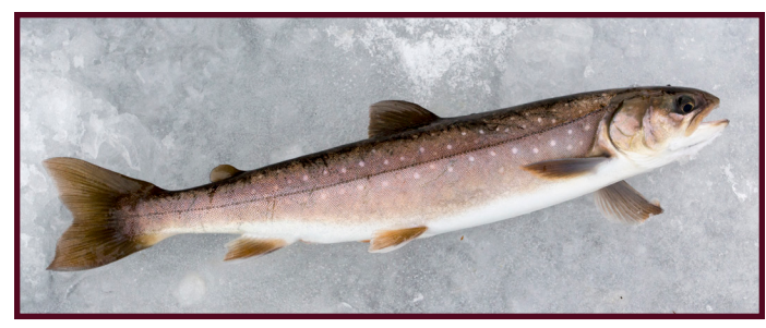
Dolly Varden/Arctic Char (Salvelinus malma/ alpinus)

There are very few native populations of rainbow trout in the Anchorage bowl area. Hatchery rainbow trout are the first fish to be stocked each spring. There are over 25 lakes and two streams (Campbell and Chester creeks), in the Anchorage area that are stocked with rainbows. Rainbow trout vary in color from silvery to dark green, with most displaying a reddish stripe along their sides and small black spots covering their entire body. Hatchery rainbow trout average eight to ten inches at the time of stocking. If not harvested, some rainbows can reach 29 inches or more.