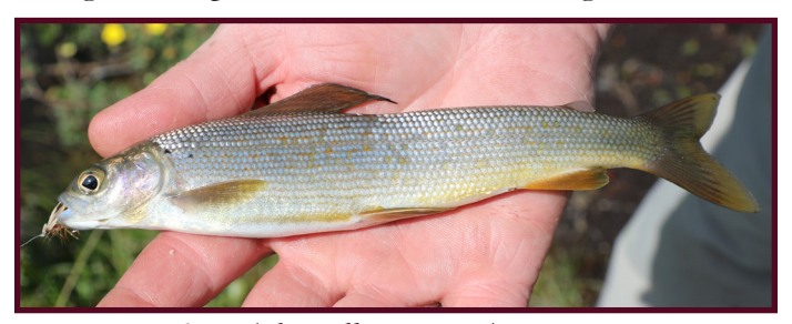
Arctic Grayling (Thymallus arcticus)

Dolly Varden are distinguished by light-colored spots on their backs, and pink to orange spots on their backs and sides. These colors become more pronounced during the fall when Dolly Varden spawn. Hatchery-reared Arctic Char are similar in appearance to Dolly Varden, and are taking a more prominent role in Anchorage area lakes.